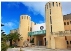
UNIVERSITY OF MALTA