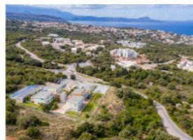
UNIVERSITY OF CRETE (GREECE)