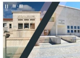
UNIVERSITY OF LISBON (PORTUGAL)