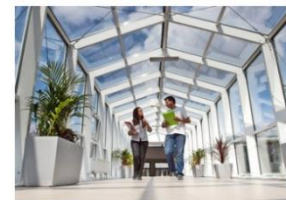
STEFAN CEI MARE UNIVERSITY (ROMANIA)

Course participants will be registered at the four Universities at all times during their course of study. They will enjoy the privileges and access to resources at the respective universities as full-time students, including library services, IT services, student associations and representation on the various boards and committees of the programme. They would need to comply with the requirements of the respective universities with regards to documentation for registration procedures and documentation for visa purposes. They will be subject to the regulations and norms which are in force in the universities where they spend their mobility period. During the implementation of EMJM FLOURISH Programme, particular attention will be given to promote the benefits of diversity, the use of inclusive language, the use of culturally responsive pedagogy and gender mainstreaming. Physical accessibility, multimodal teaching and learning facilities, and access arrangements for assessment, will be ensured throughout the programme. Students with additional educational needs (AEN) will be provided with the requisite provisions, services and supports according to their needs. All four campuses are fully accessible for persons with physical and sensory disability and have in place policies and guidelines for students with additional educational needs.